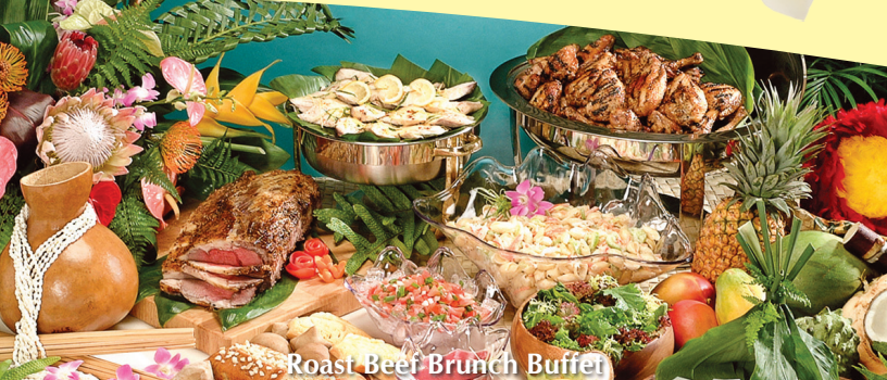
Roast Beef Brunch Buffet