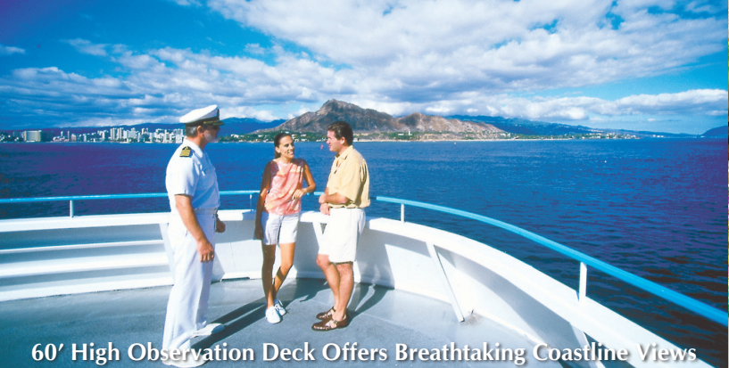
60' High Observation Deck Offers Breathtaking Coastline Views