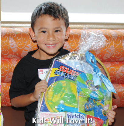
Kids Will Love It!