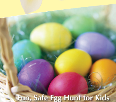
Fun, Safe Egg Hunt for Kids

Perfect for the Whole Family! $73.00 adult, $44.00 child