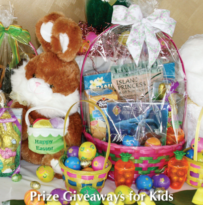
Prize Giveaways for Kids