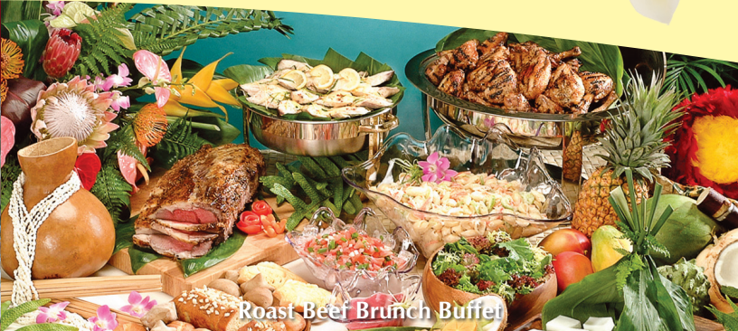
Roast Beef Brunch Buffet