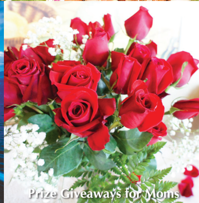
Prize Giveaways for Moms