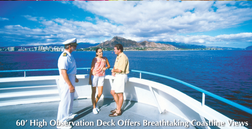
60' High Observation Deck Offers Breathtaking Coastline Views