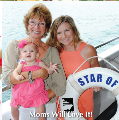
Moms Will Love It!