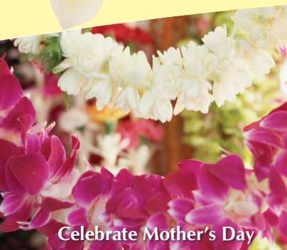
Celebrate Mother's Day

Treat Mom to a Relaxing Day in Paradise! $73.00 adult, $44.00 child