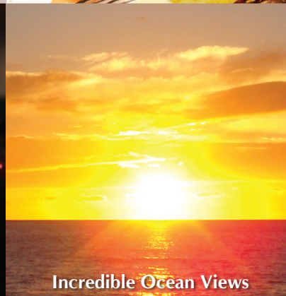
Incredible Ocean Views