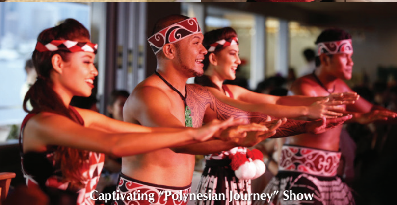
Captivating "Polynesian Journey" Show