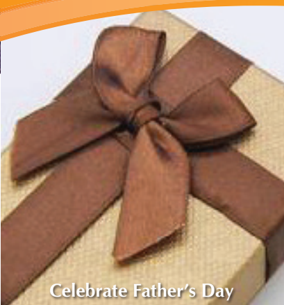
Celebrate Father's Day

Treat Dad to a Fun Tropical Evening! $97.00 adult, $58.00 child