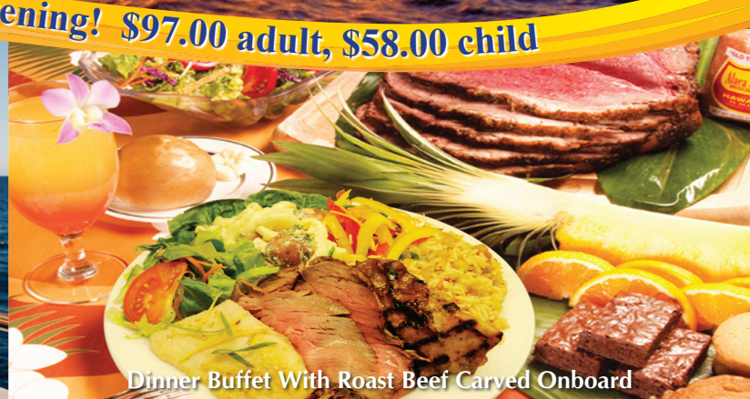
Dinner Buffet With Roast Beef Carved Onboard