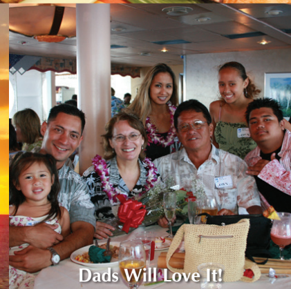
Dads Will Love It!