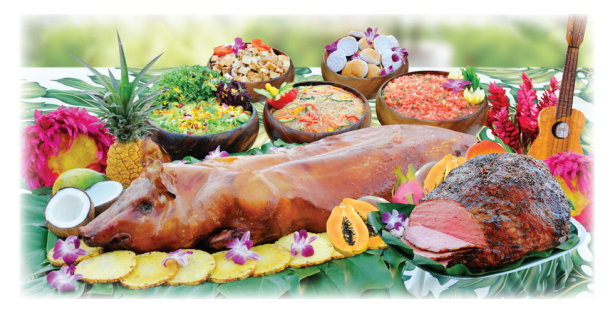
At Your Table Whole Fresh Maui Gold<sup>®</sup> Sweet Pineapple* Family Style

Carving Station Island Roasted Whole Suckling Pig USDA Choice Top Round Grade Roast Beef Black Sea Salt