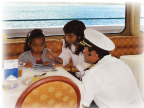
New Keiki (Child) Program