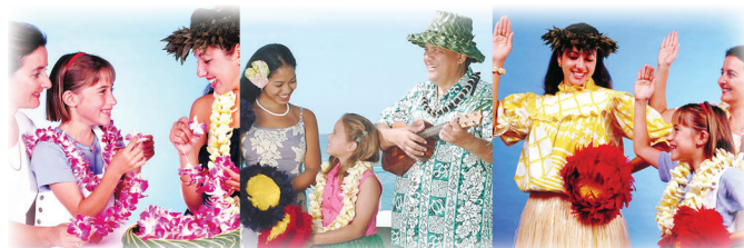
Lei Making, Ukulele and Hula Lessons