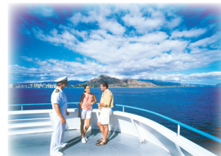
60' High Observation Deck