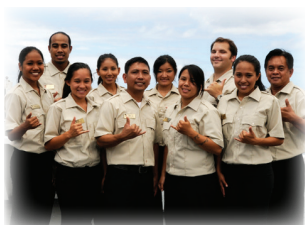
Trained Naturalist Crew