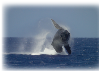
Whale Breach Taken from the STAR