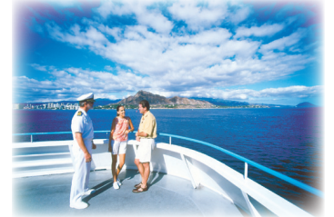
Best Seat at Sea