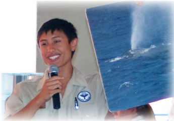
Trained Naturalist Crew