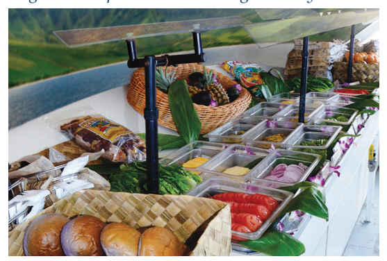
Freshly Grilled Onboard Premium All Beef Hamburgers

Selection of Buns Freshly Baked Taro or Kaiser Buns