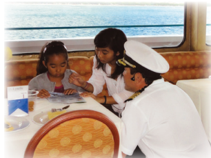
New Keiki (Child) Program