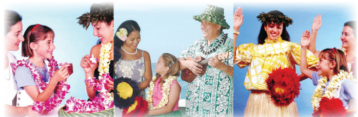
Lei Making, Ukulele and Hula Lessons