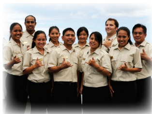
Trained Naturalist Crew