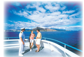
60' High Observation Deck