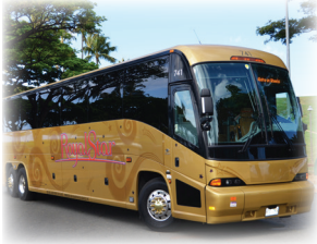
Royal Star® Deluxe Gold Motorcoach will pick you up

In the comfort of a Royal Star® vehicle with seat belt, advanced audio / video system and Royal Star driver guide.