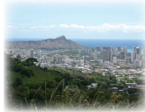
Diamond Head (5 minutes)