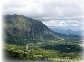
Nuuanu Pali (10 minutes)