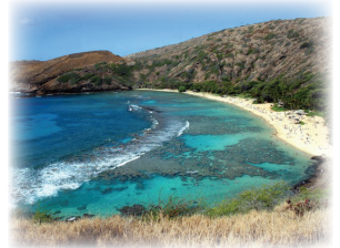
Hanauma Bay (10 minutes)