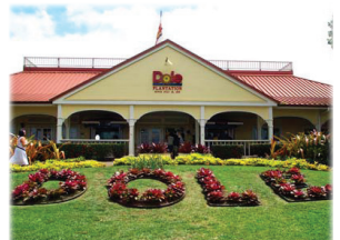
Dole Plantation (30 minutes)