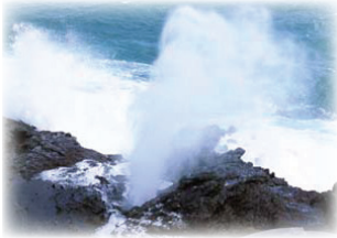
Halona Blow Hole (5 minutes)