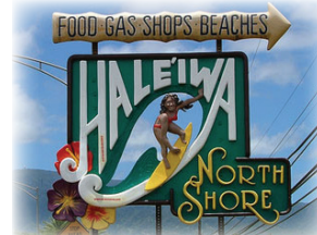
Haleiwa Town (90 minutes)