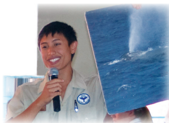
Trained Naturalist Crew