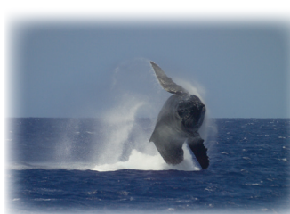
Whale Breach