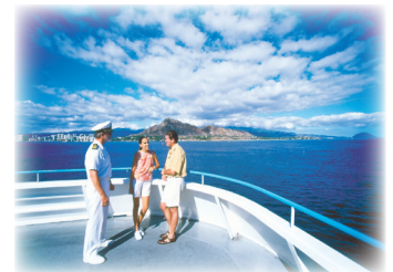
Best Seat at Sea