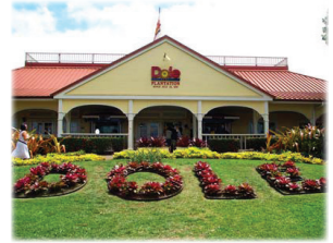
Dole Plantation (30 minutes)