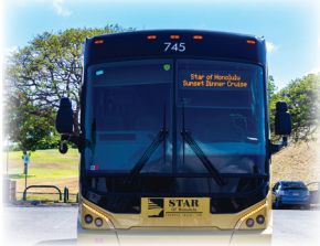
Group Name in Digital Signage