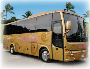
Deluxe Gold Motorcoach

In the comfort of a Royal Star® vehicle with seat belt, advanced audio / video system and Royal Star® driver guide.