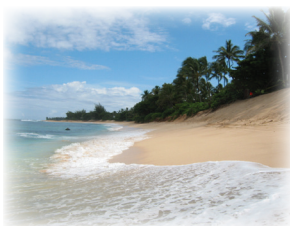
North Shore Beach (5-minute photo stop)