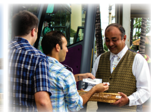
Mint and Hand Towelette Service