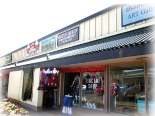
Browse through Shops