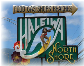
Haleiwa Town (90 minutes)