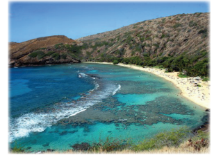
Hanauma Bay (10 minutes)