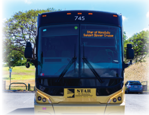
Group Name in Digital Signage