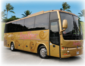
Deluxe Gold Motorcoach

In the comfort of a Royal Star® vehicle with seat belt, advanced audio / video system and Royal Star® driver guide.