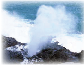
Halona Blow Hole (5 minutes)