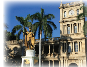
Downtown Honolulu (Window view)