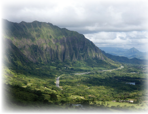
Nuuanu Pali (10 minutes)