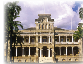
I'olani Palace (Window view)