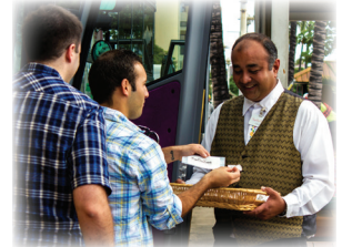
Mint and Hand Towelette Service