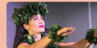
Polynesian Show with Audience Participation