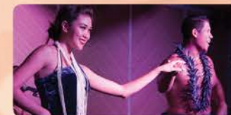
Polynesian Show & Strolling Musician