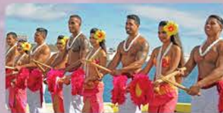
Welcome Hula Memorable Hawaiian Greeting

5:30 – 7:30PM / Disembark Casual Elegance Delivered with Aloha