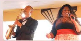
Live Jazz during Dinner