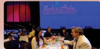
Hawaiian Recording Music during dinner