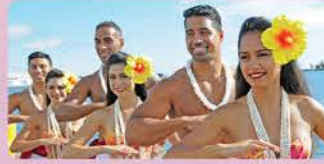
Welcome Hula upon Boarding

5:30 – 8:00PM / Disembark The Ultimate in Luxury and Romance