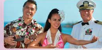
Hawaiian Music Captain's Welcome Reception