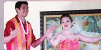
Bon Voyage Hula Get Ready to Take Photos