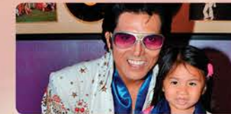
Meet&Greet® Instagram or Skype your Family