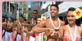
Pier-Side Welcome Hula by our Beautiful Dancers

5:30 – 7:30PM / Disembark Buffet Dining & Tropical Fun