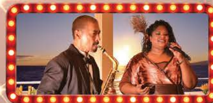
THE JAZZ $2,500