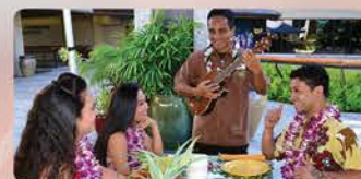
Live Hawaiian Entertainment Join in for Hula Lessons