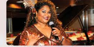
Dance the Night Away Unforgettable!