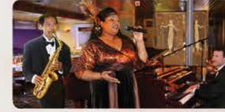
Live Jazz Entertainment by Oahu's Top Artist Trio