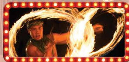
ENCHANTING PACIFIC $5,000

New Service! Now you can have professional Hawaiian Entertainment you see at Star of Honolulu® or Rock-A-Hula® @ Your Place. Visit ParadiseToGo.com for more information!