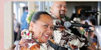
Live Hawaiian Music during Dinner