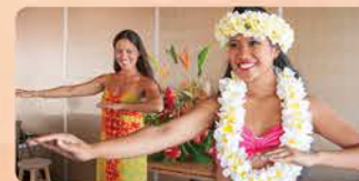
Hula Lesson Fun & Memorable