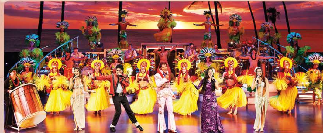
Biggest Hawaiian Show in Waikiki A "Hawaiian Journey®" from 1920s to Current through Powerful Performances of Music & Dance