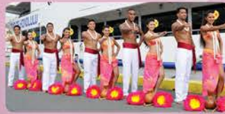
Pier-Side Welcome Hula Get Ready to Take Photos

5:30 – 7:45PM / Disembark The Deluxe Way to Cruise in Style