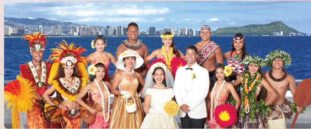
Brand New Show Begins with a Wedding in 1957 Featuring a Newlywed Couple's Travel Through "60 Years of Aloha®"