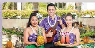
Welcome Hula Starts Your Aloha-Filled Night