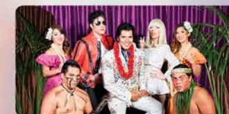
Meet&Greet® Meet the Cast Members