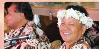
Live Hawaiian Music during Dinner