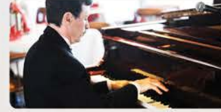
Pianist Plays Favorite Songs during Dinner