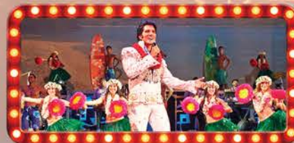
THE ELVIS $2,500