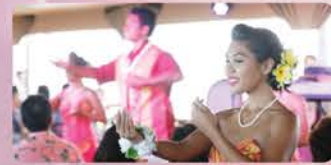
Bon Voyage Hula Onboard