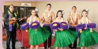
Welcome Hula Sets the Mood for a Fun Night