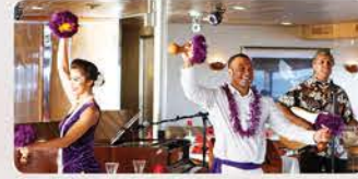
Bon Voyage Hula in Super Nova® Room