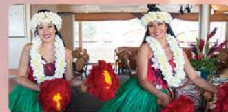
Bon Voyage Hula with a Medley of Songs